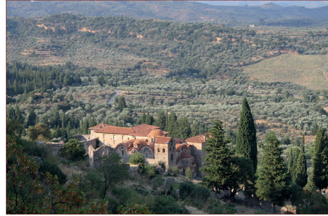
Pantanassa Monastery, Mystras, Greece.