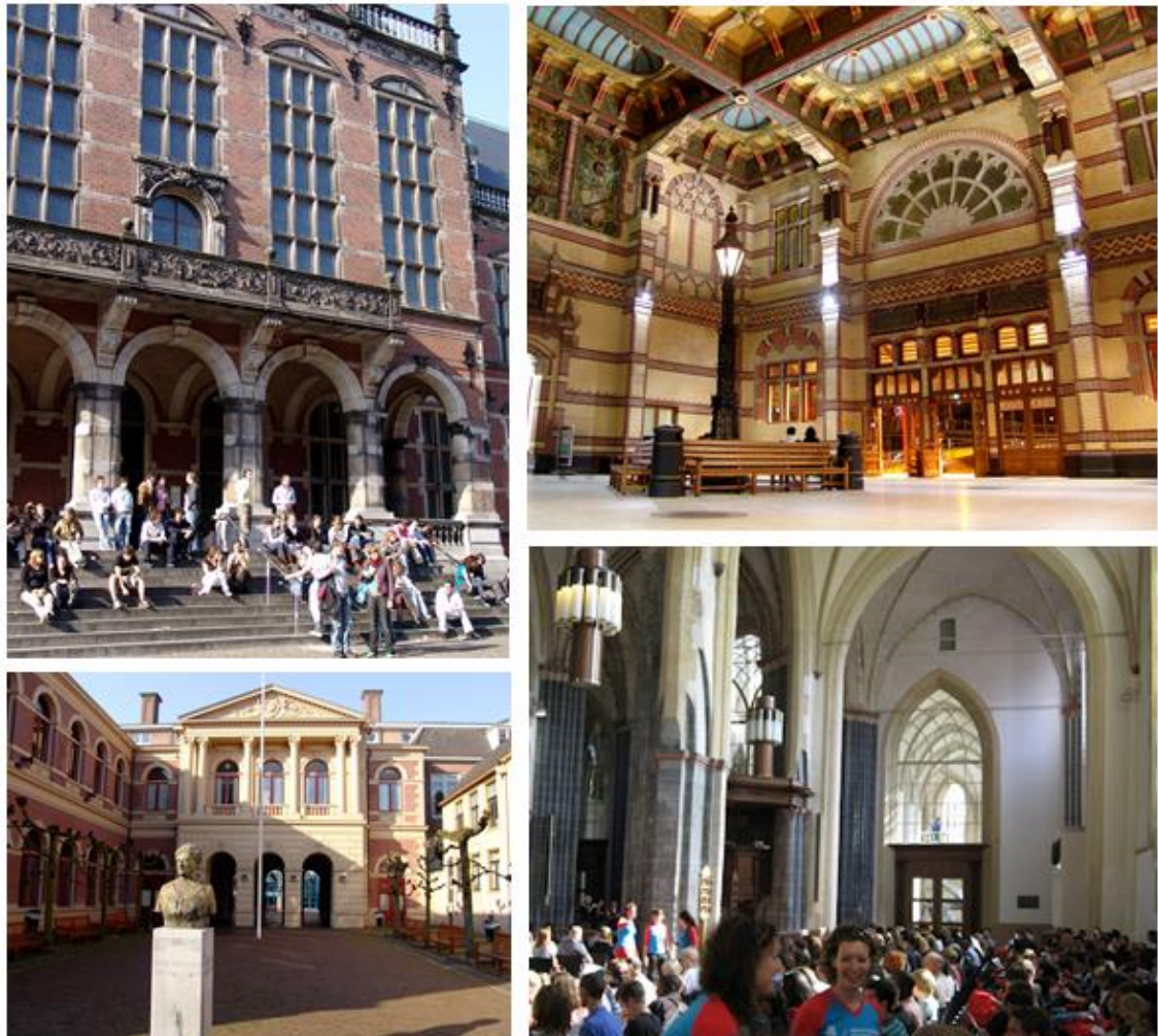
Clockwise: Enjoying the sun in front of the Academy Building, arrival hall Groningen central station, Welcoming Ceremony in the Martini Church, and the Harmonie Building with the statue of Aletta Jacobs.