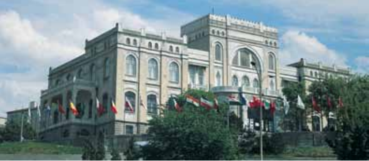
Etnografya Müzesi, Ankara