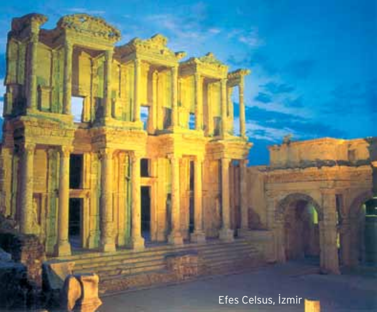
Efes Celsus, İzmir