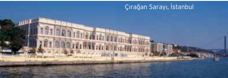
Çırağan Sarayı, İstanbul