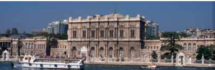
Çırağan Sarayı, İstanbul