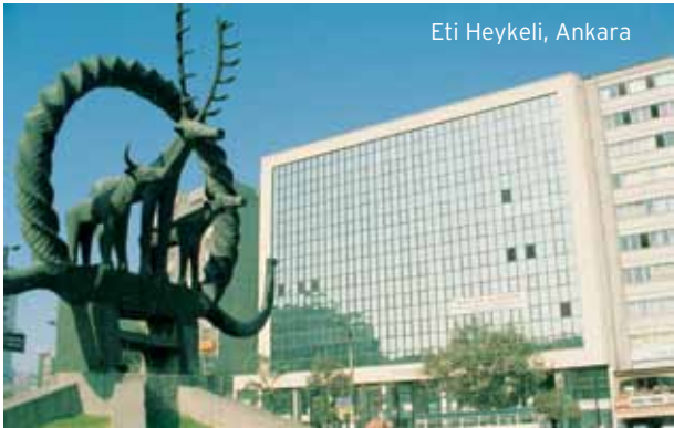
Eti Heykeli, Ankara