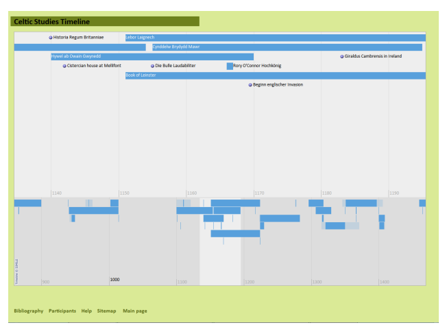
Figure 3: Interactive Timeline, Grundbegriffe der Keltologie, Summer Term 2013 Timeline program code by: http://www.simile-widgets.org