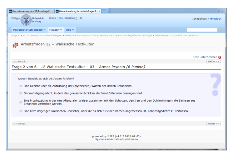
Figure 1: Online test – "Grundbegriffe der Keltologie, Summer Term 2013"