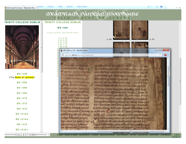
Figure 5: MS TCD 1339 (Book of Leinster)