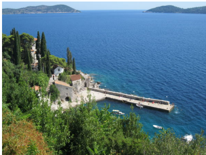
Arboretum, Dubrovnik, Croatia