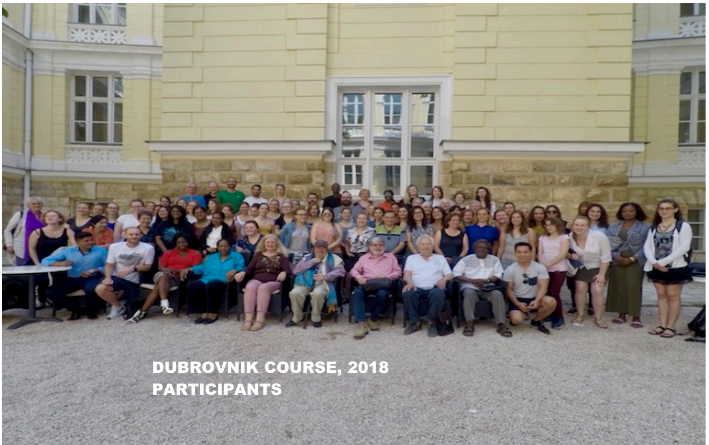
DUBROVNIK COURSE, 2018 PARTICIPANTS