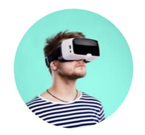
Digital and media culture