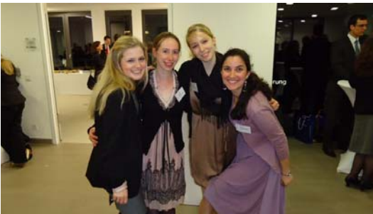
April 13, 2011

From Thursday to Saturday we participated with 21 other teams in the pre-moot in Düsseldorf. We established many new contacts and met challenging teams from Guildford (England), Brno (Czech Republic), Cracow (Poland) and Sydney (Australia). It was a great opportunity to practice our pleadings once again with teams from other jurisdictions before we will leave for Vienna next Thursday.