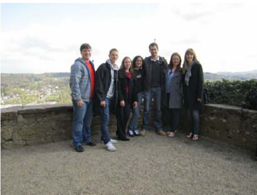
April 26, 2011

Yesterday, the Team from Queen's University (Canada) visited us in Marburg. After a short tour through the city - we visited the Elisabeth Church, the "Oberstadt" and the castle - we had two more practice pleadings. Afterwards, we concluded the day together with a dinner. It was a pleasure for us to have the Queen's team in Marburg and we enjoyed the time spent together very much.