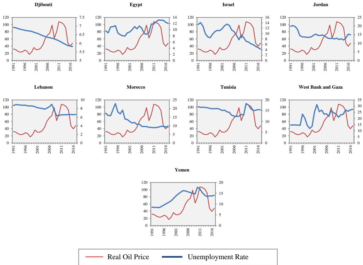
Figure 2. Unemployment rate of oil-importing countries and real oil prices (USD)