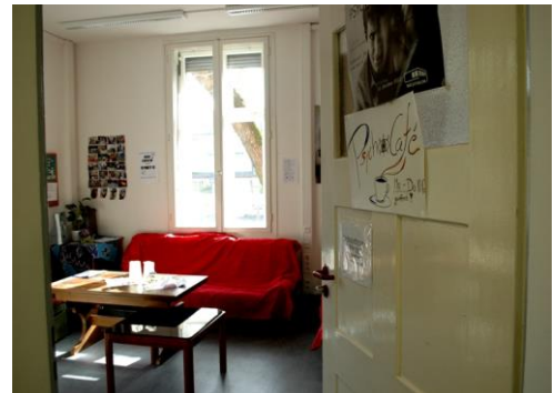
Figure 2. Psycho-Café

The student council of the Department of Psychology, the so called “Fachschaft”, serves as contact and representation for the students of the department and their interests. The Fachschaft puts together an orientation for new students of the department at the start of each fall semester. It also organizes the annual Summer and Christmas parties, and the “Psycho Film Series” (Psycho-Kino), where films with a psychological background can