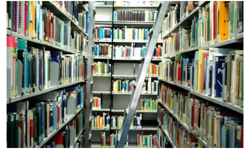
Figure 1. Library

The library of the Department of Psychology is located on the ground floor. It offers a wide range of psychological literature. Entering through the main entrance, you'll need to turn to your right and you will find the library at the end of the hallway. The library is open from Monday to Friday from 8.00 a.m. to 6.00 p.m. On weekends and public holidays the library remains closed. It offers a wide range of psychological literature in English and German.